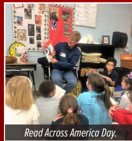
Read Across America Day.