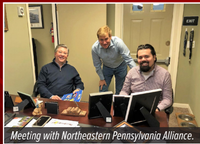
Meeting with Northeastern Pennsylvania Alliance.