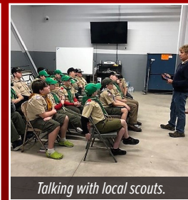
Talking with local scouts.