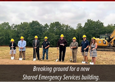
Breaking ground for a new Shared Emergency Services building.