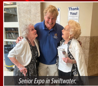
Senior Expo in Swiftwater.